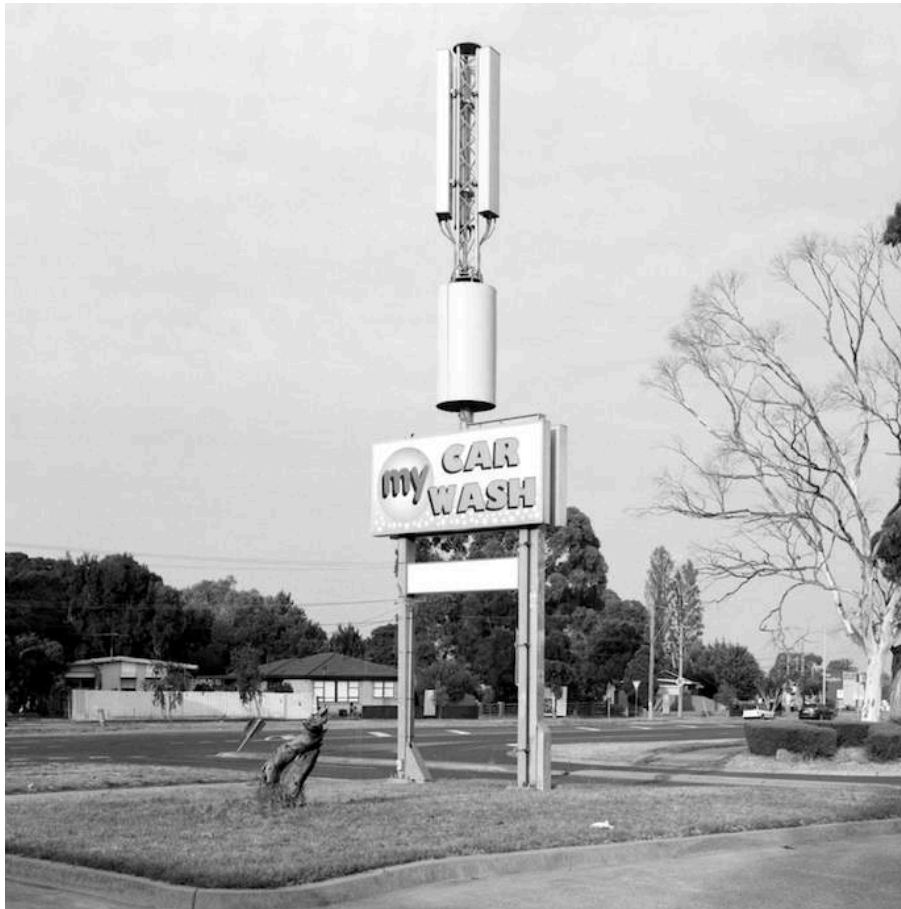
1 Ballarto Rd, Carrum Downs, part of the series 'Some Cell Sites', 2019, Archival inkjet pigment print, 60cm x 60cm

Some Cell Sites is Davison's recent exploration of mobile phone base stations across Australia.