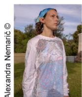
Alexandra Nemarič ©