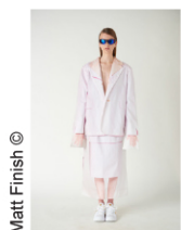
Matt Finish ©