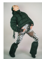
Love Manifesto ©