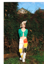
Moss Tunstall ©

See Moss Tunstall wearables featuring acid-washed and painted all-over denims, experimental designs, as well as the label's new exaggerated denim hat.